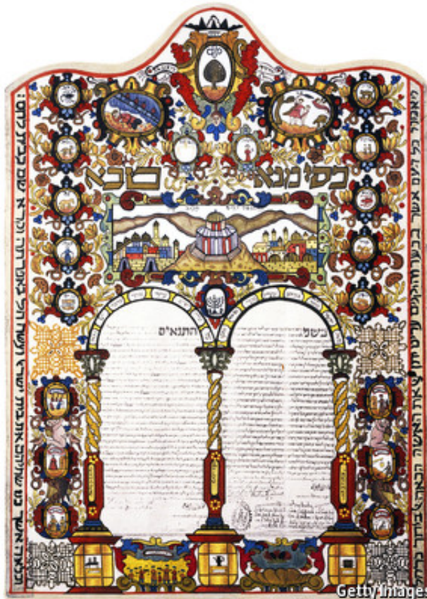
The ketubah: beautiful and powerful

These two attitudes imply very different futures. In one the Orthodox, with their strong retention and very high birth rates, will represent a rising share of the Jewish population